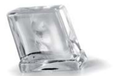
Half Cube - 6 g (13 x 26,5 x 26 mm)