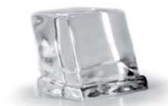
Full Cube - 12 G (26,5 x 26,5 x 26 mm)