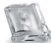
Half Cube - 6 g (13 x 26,5 x 26 mm)