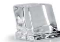
Full Cube - 12 G (26,5 x 26,5 x 26 mm)